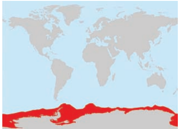
Emperor Penguin geographical range – © IUCN Red List

Phil Trathan British Antarctic Survey pnt@bas.ac.uk +44 1223 221602