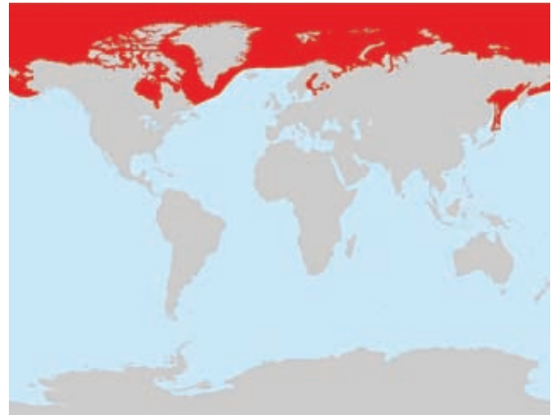
Ringed seal geographic distribution