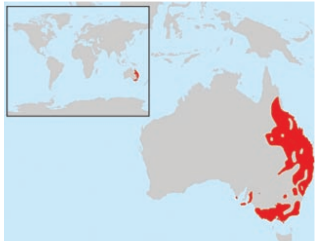
Koala geographical range

The Macaulay Land Use Research Institute, United Kingdom b.moore@macaulay.ac.uk