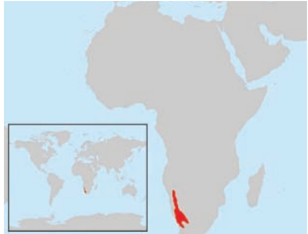
Quiver Tree geographical range

South African National Biodiversity Institute g.midgley@sanbi.org.za