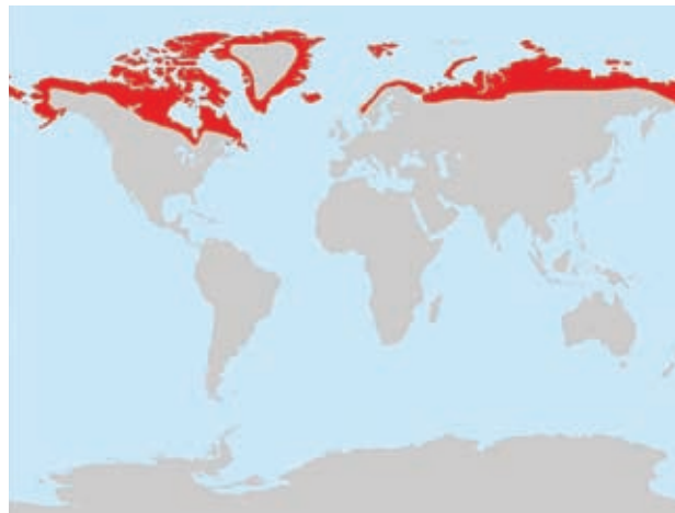
Arctic Fox geographical range

Department of Zoology, Stockholm University anders.angerbjorn@zoologi.su.se +46 8 16 40 35