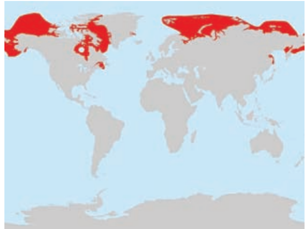
Beluga Whale geographical range

Chairperson: IUCN SSC Cetacean Specialist Group Wildlife Associates, Canada rrreeves@okapis.ca