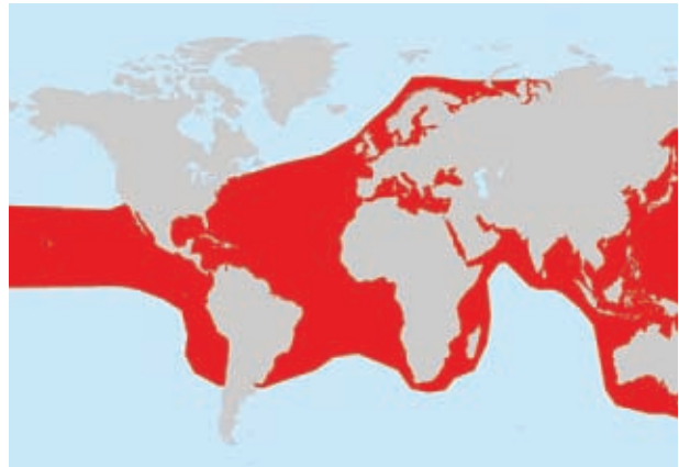
Leatherback Turtle geographical range – © IUCN Red List

Conservation International b.wallace@conservation.org