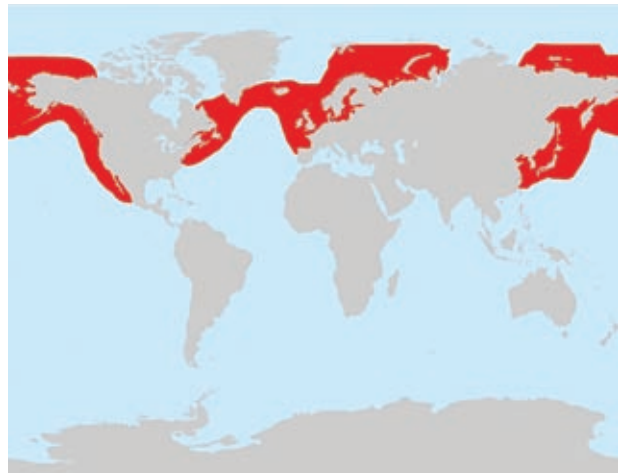
Salmon geographical range – © IUCN Red List

- Pete Rand, IUCN SSC Salmonid Specialist Group