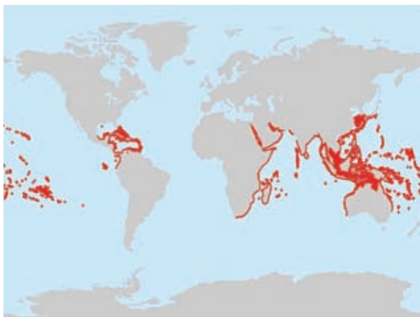
Staghorn coral geographical distribution © IUCN Red List